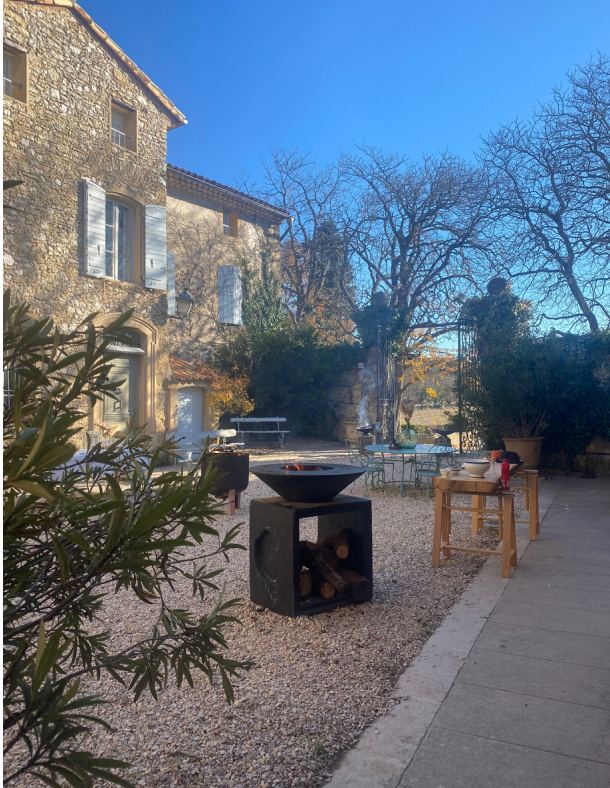
PRICES (for information only, estimates on request)